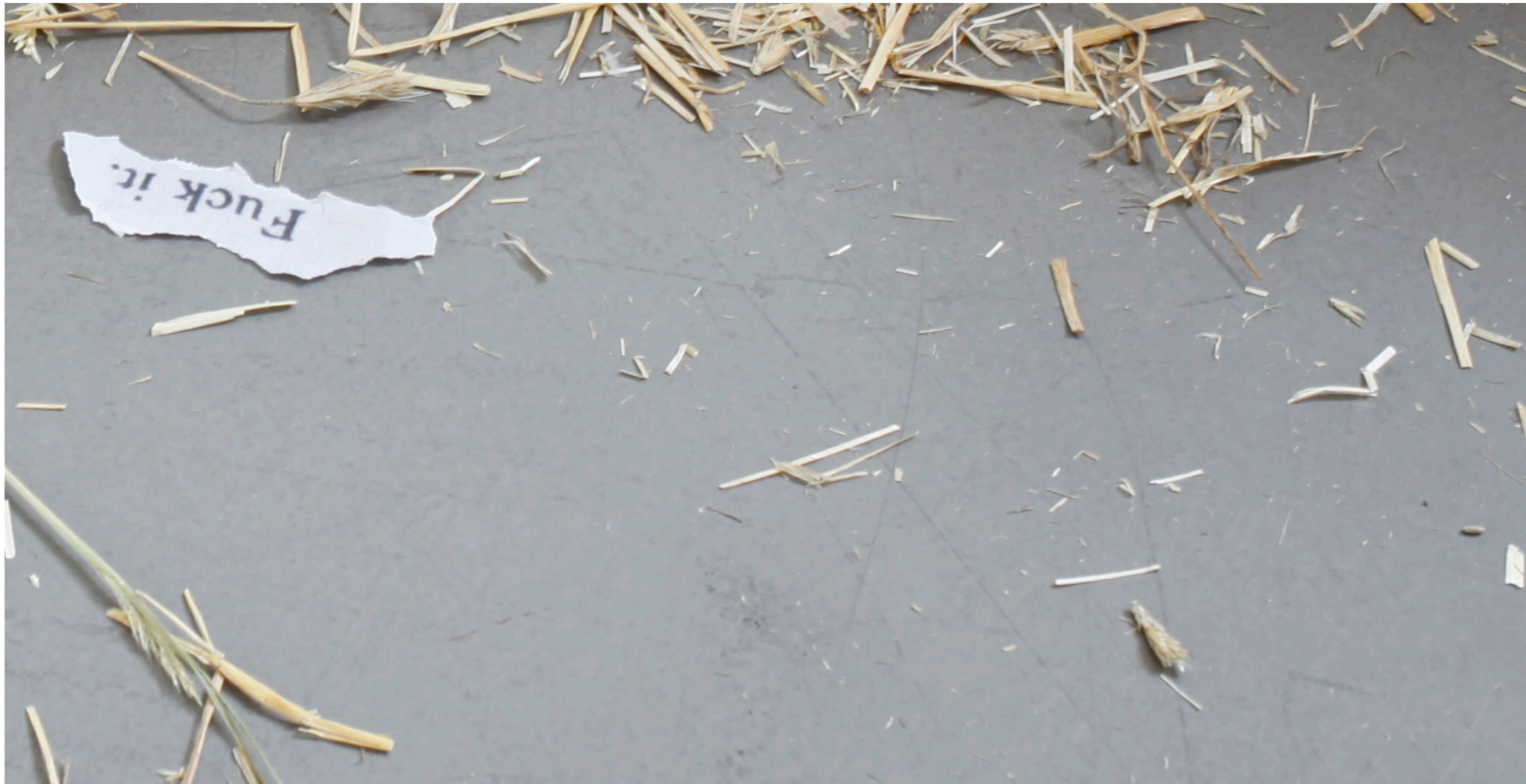
Calling the Ghosts... , 2019 / Detail / Stroh, Acryl, Papierschnipsel, Auszug aus „Cowboy's Mouth“ Patti Smith, Sam Shepard