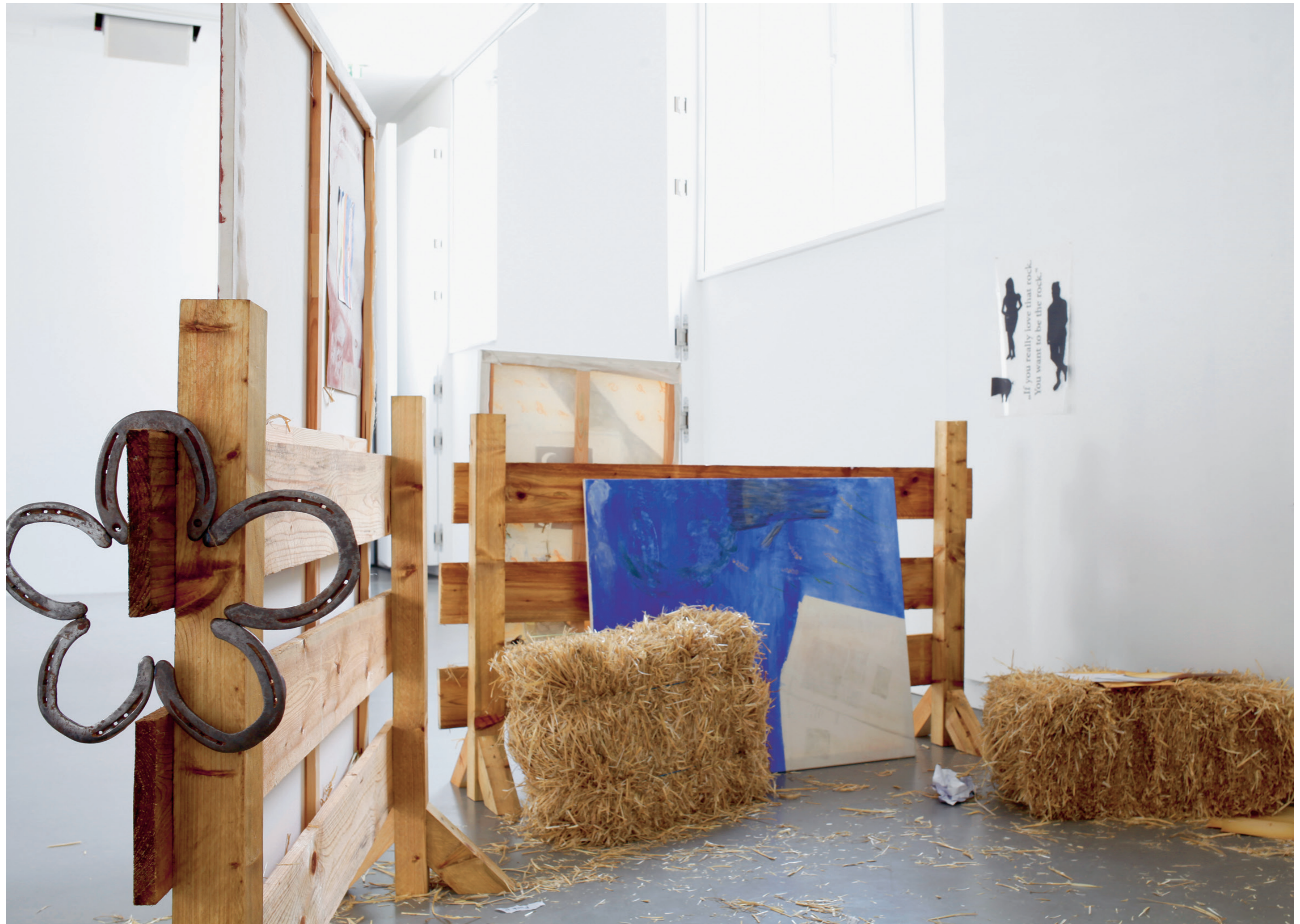
Calling the Ghosts... , 2019 / Ausstellungsansicht / Stroh, Acryl, Bleistift auf Leinwand, Hufeisen, Holzzaun, Papier / Maße variabel