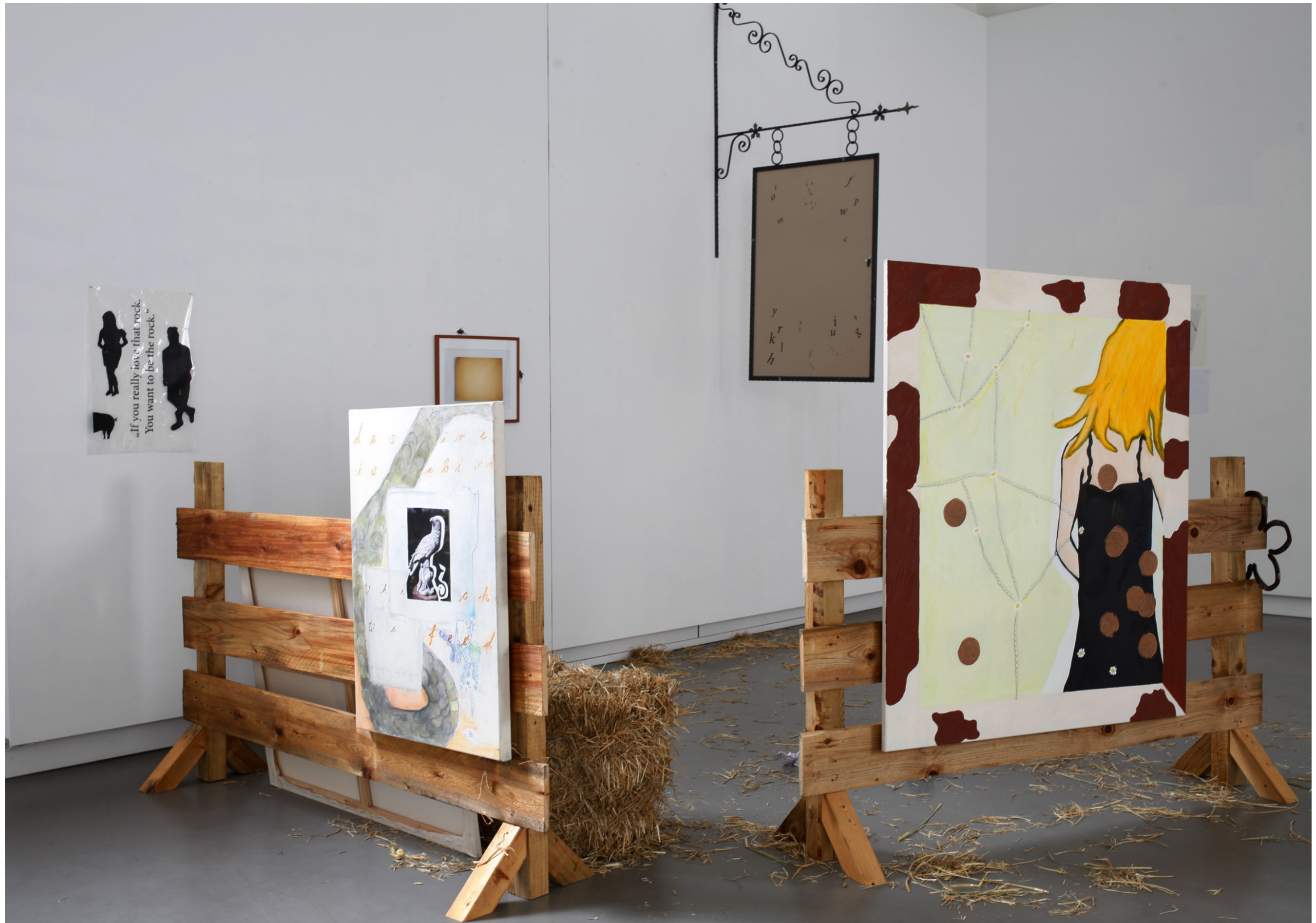
Calling the Ghosts..., 2019 / Ausstellungsansicht / Stroh, Acryl, Bleistift, Öl auf Leinwand, Hufeisen, Schmiedeeisen, Holzzaun, Papier / Maße variabel