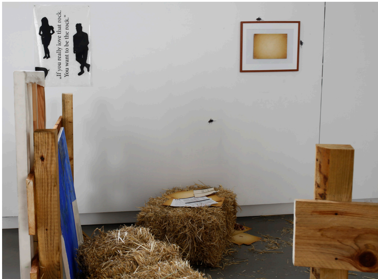
Calling the Ghosts..., 2019 / Detail & Ausstellungsansicht