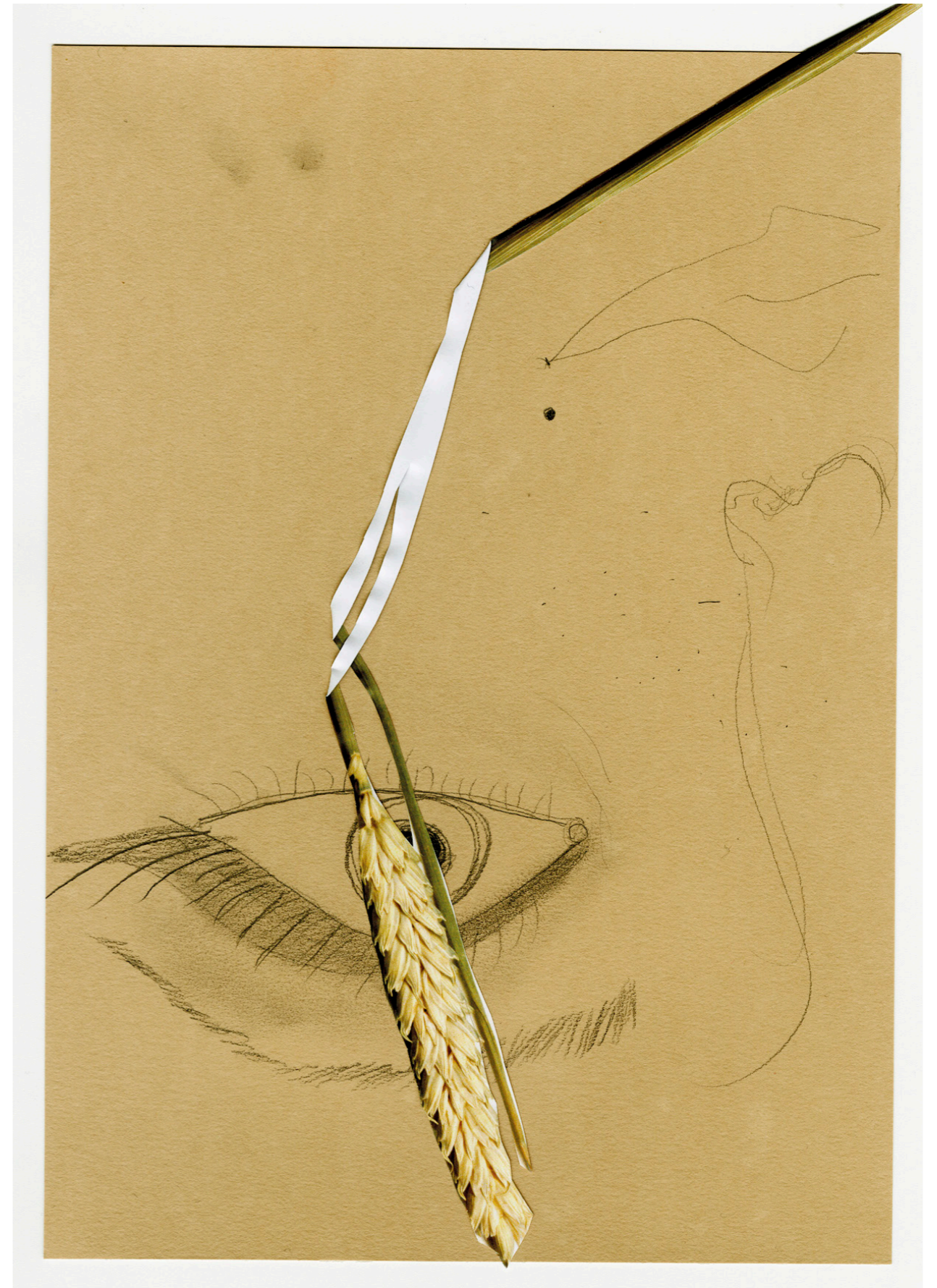
Corn-eye, 2019 / Collage, Bleistiftzeichnung, Fotokopie / 21x29,7cm