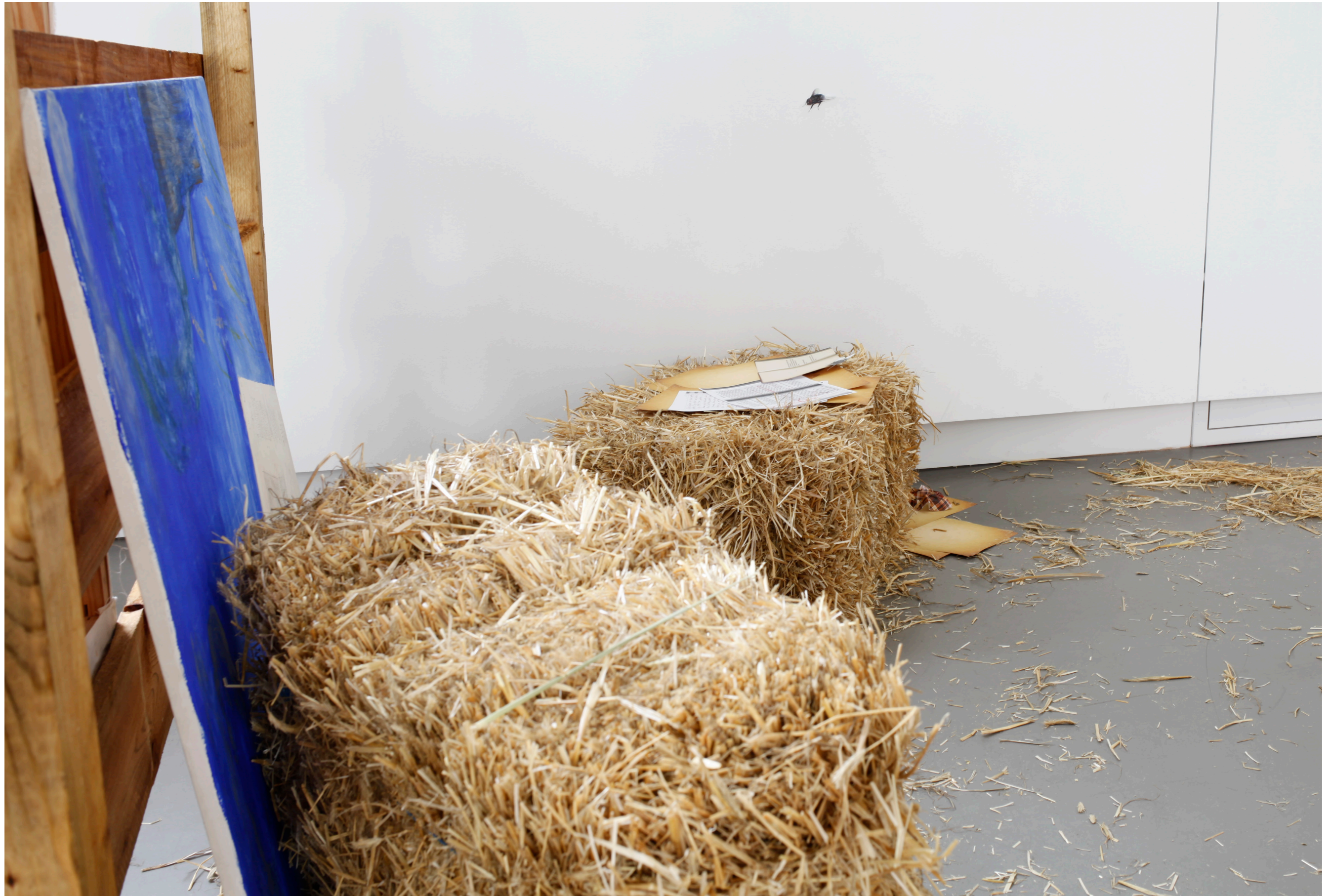
Calling the Ghosts... , 2019 / Detail / Stroh, Acryl, Bleistift auf Leinwand, Hufeisen, Holzzaun, Papier / Maße variabel