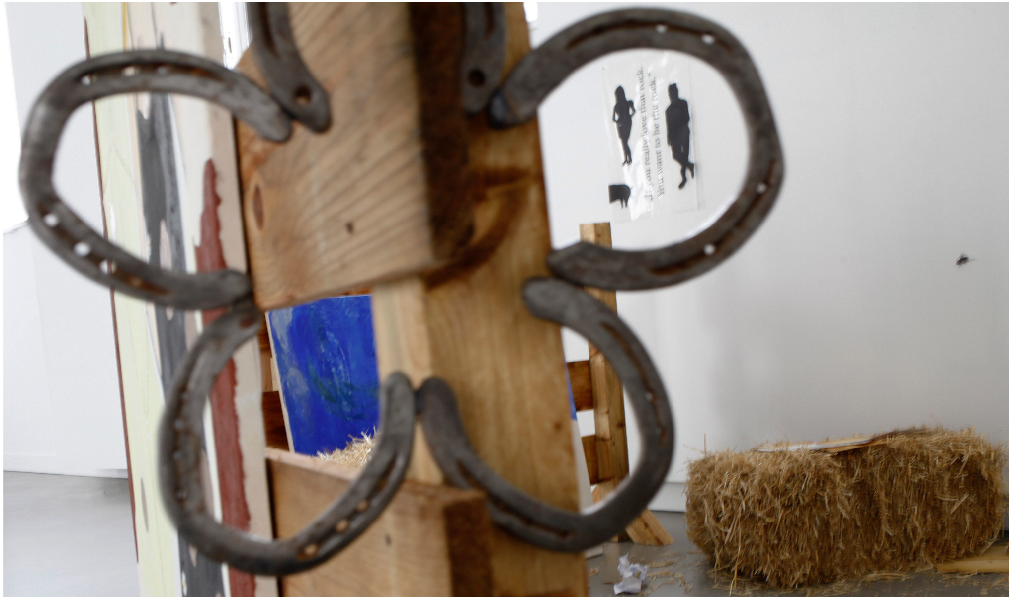
Calling the Ghosts... , 2019 / Detail / Stroh, Acryl, Bleistift auf Leinwand, Hufeisen, Holzzaun, Papier / Maße variabel